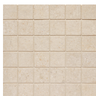
2 x 2 Mosaic Mesh