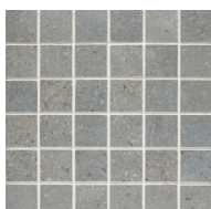
2 x 2 Mosaic Mesh