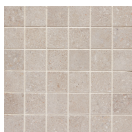
2 x 2 Mosaic Mesh

When installing rectangular or square tiles 15 inches or longer with a staggered joint, it is recommended that the offset should not exceed 33%, unless otherwise specified by the manufacturer.