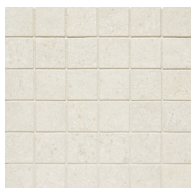
2 x 2 Mosaic Mesh