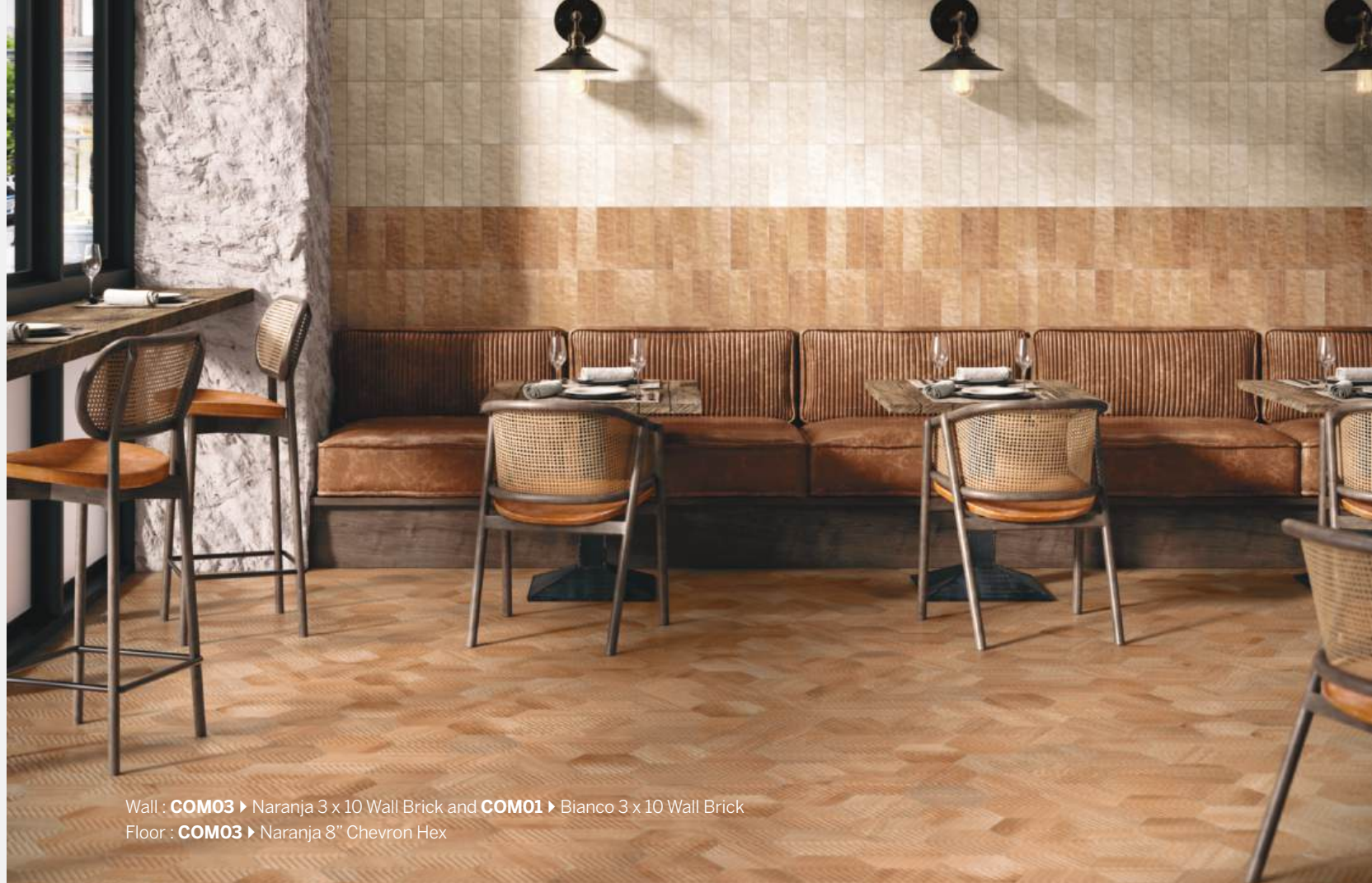
Wall : COM03 ▶ Naranja 3 x 10 Wall Brick and COM01 ▶ Bianco 3 x 10 Wall Brick Floor : COM03 ▶ Naranja 8" Chevron Hex