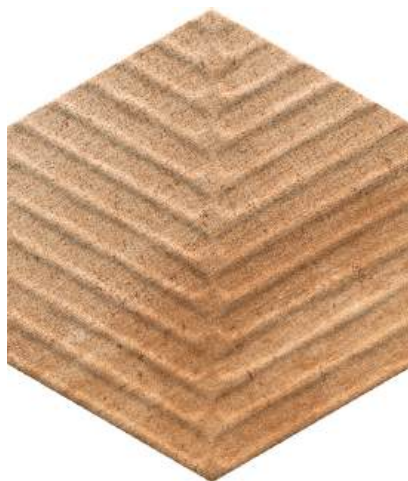
COM03 ▶ Naranja 8" Chevron Hex