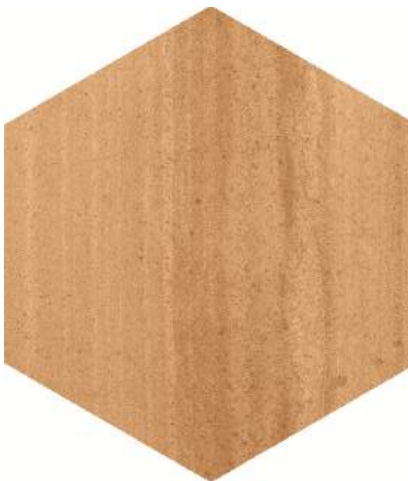
COM03 ▶ Naranja 8" Flat Hex