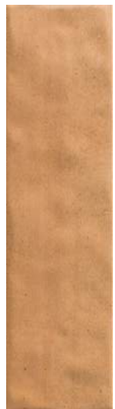
COM03 ▶ Naranja 3 x 10 Undulating Wall Brick*