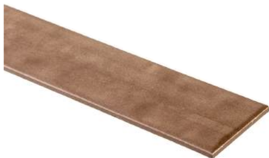
Detail of the Marron 3 x 10 Undulating Wall Tile Surface