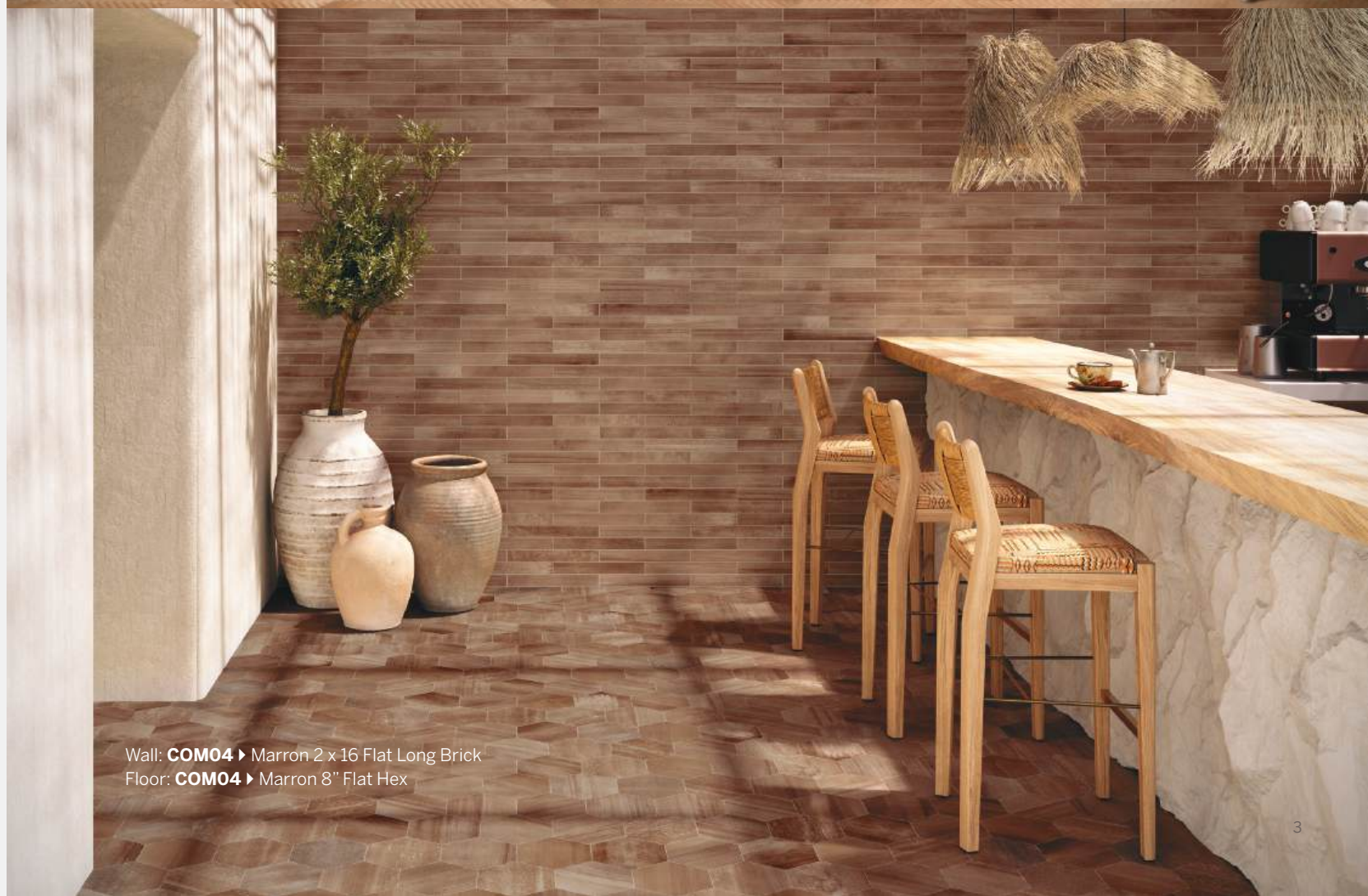
Wall: COM04 ▶ Marron 2 x 16 Flat Long Brick Floor: COM04 ▶ Marron 8" Flat Hex