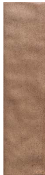
COM04 ▶ Marron 3 x 10 Undulating Wall Brick*