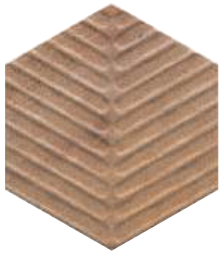
8" Chevron Hex