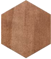
8" Flat Hex