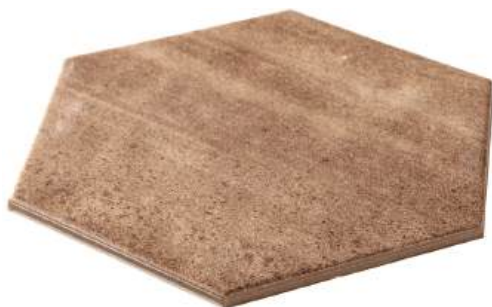
Detail of the Marron Flat Hex Surface