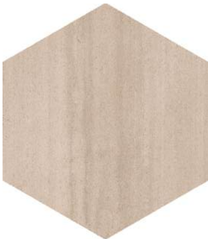
COM02 ▶ Taupe 8" Flat Hex