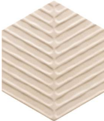
COM01 ▶ Blanco 8" Chevron Hex