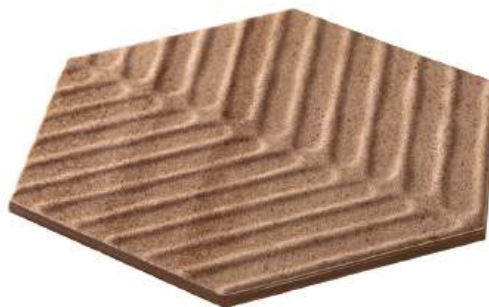
Detail of the Marron Chevron Hex Surface