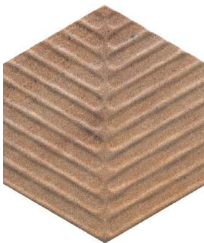
COM04 ▶ Marron 8" Chevron Hex