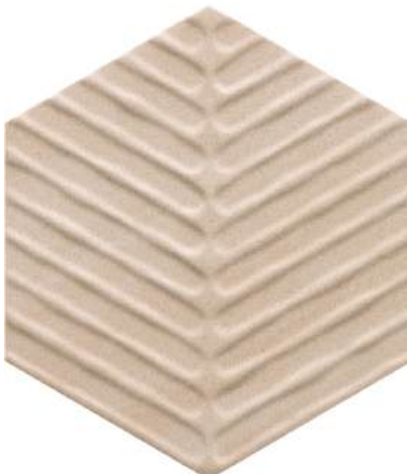
COM02 ▶ Taupe 8" Chevron Hex