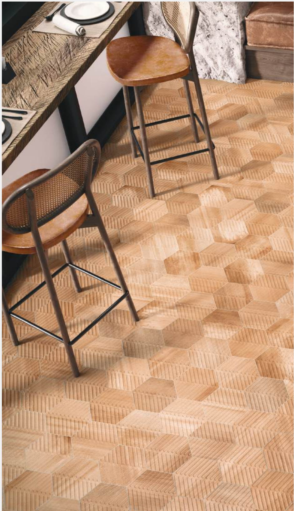
COM03 › Naranja 8" Chevron Hex

Available in four clay and terracotta tones, Cotto Moderno is anything but traditional. The bohemian style and artisanal make up of each unique tile bring nature's energy to your vision.