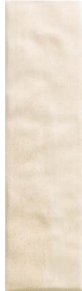
COM01 ▶ Blanco 3 x 10 Undulating Wall Brick*