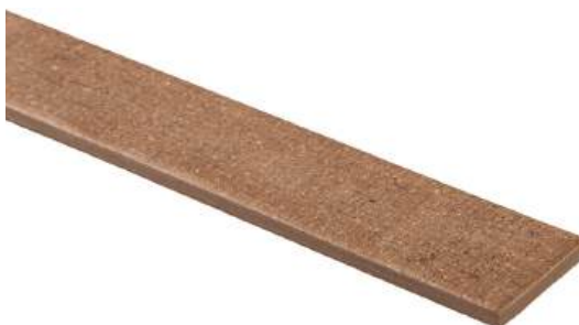
Detail of the Marron 2 x 16 Long Brick Surface