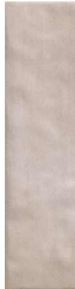
COM02 ▶ Taupe 3 x 10 Undulating Wall Brick*