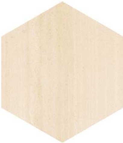
COM01 ▶ Blanco 8" Flat Hex