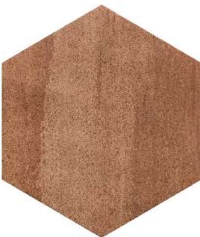
COM04 ▶ Marron 8" Flat Hex