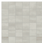
2 × 2 Mosaic Mesh