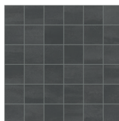
2 × 2 Mosaic Mesh