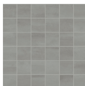
2 × 2 Mosaic Mesh

The Reflexion (Reflex) series has the shimmering look of metal, with its infinite transformations of light and reflections is combined with the solid mood of concrete which adds an urban feeling and a modern taste to every environment. Because this material is a porcelain product, minimal maintenance is required.