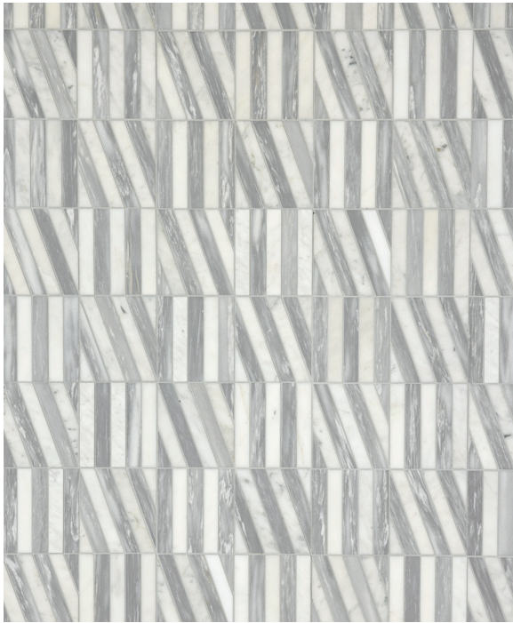
ZigZag Blanc/Luna Honed Mesh