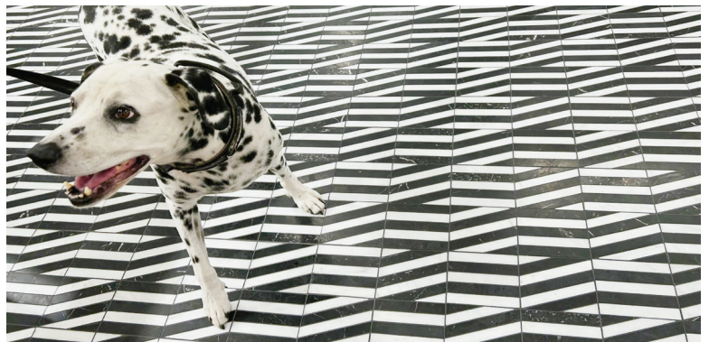
ZigZag Noir/Blanc Honed Mesh

Piece to piece variation in shade or color are inherent in all-natural stone products; therefore, when installing natural stone tile, it is recommended to mix tiles from several boxes at a time during installation to achieve the best range of color. As natural stone products, it is recommended that these be sealed to extend their longevity. When installing white marble, you must use a white thinset; using grey thinset will leave trowel lines and could stain the marble. It is recommended to use a grout color that coordinates with the lightest color stone.