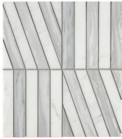
ZigZag Blanc/Luna Honed Mesh (0.87 sf/sht)