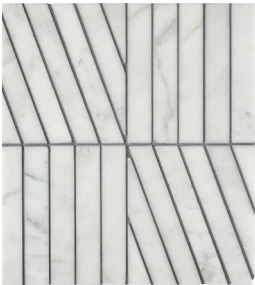
ZigZag Blanc Honed Mesh (0.87 sf/sht)