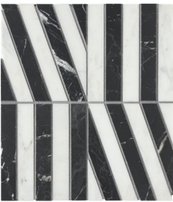
ZigZag Noir/Blanc Honed Mesh (0.87 sf/sht)