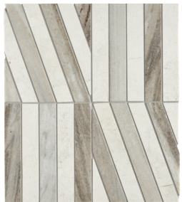
ZigZag Crema/Sky Honed Mesh (0.87 sf/sht)